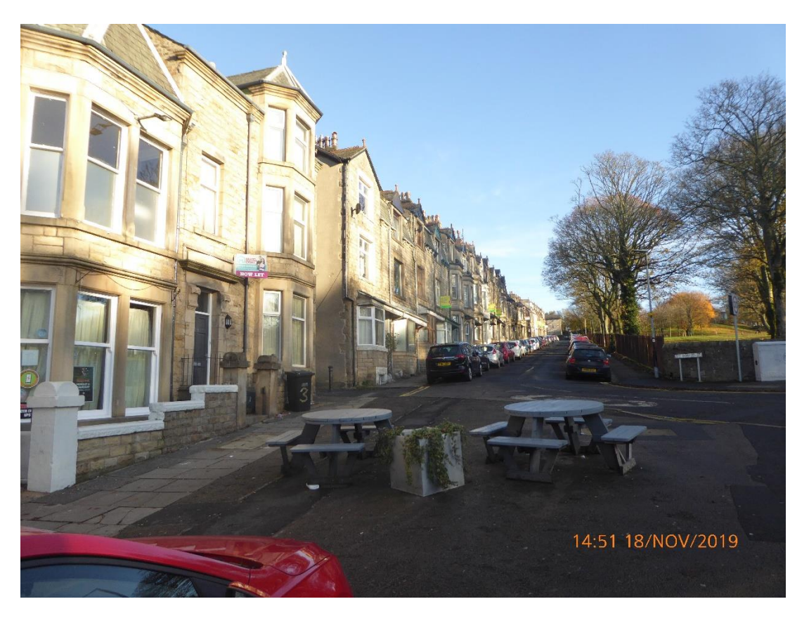
St. Oswald Street